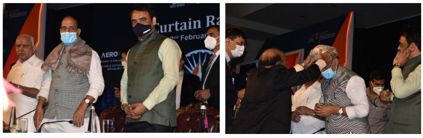
Photo taken on the occasion of BCIC delegation led by Mr. T R Parasuraman, President felicitating Shri. Rajnath Singh, Hon'ble Minister of Defence, Government of India

BCIC was invited by the Office of Commissioner for Industrial Development and Director of Industries and Commerce, Government of Karnataka for the felicitation of Shri. Rajnath Singh, Hon'ble Minister of Defence, Government of India to acknowledge the support of the Central Government to the Aerospace& Defence Sector Industries of the State.