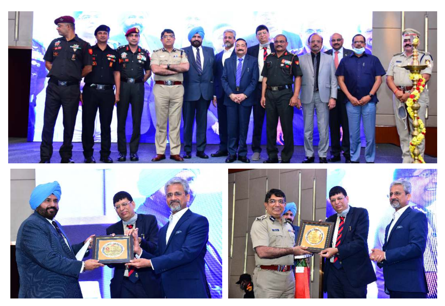
The entire Workshop was sponsored by Brigade Hospitality